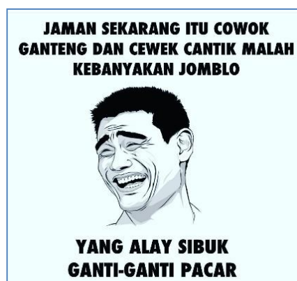
Figure 2. Yaoming meme made by an Indonesian creator

The references to "Education" and "Popular Culture" depicts us the conundrum of education in Indonesia right now relating to those aspects such as "untuk apa mikirin un/ un belum tentu mikin kita". That aspect often happens on the adolescences. Thus, the creator wants to propose this idea to the adolescence as the majority of internet user in memetic society.