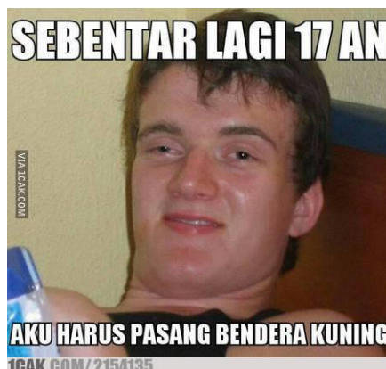
Figure 4: The model of Stanley Stoner meme accepted by the memetic community

to show him as brainless talker such as “ digigit anjing/ langsung demam berdarah ”. This meme actually intended to become a one-liner joke but again this absurdity does make any sense at all.