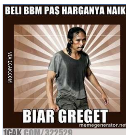
Figure 3: The model of Mad Dog meme which is accepted by the memetic community

Although this meme is initially coming from Indonesia, it is still being misapprehended by most netizen and meme creators. From the data, it had been shown that sometimes particular creator makes the Mad Dog icon become someone who loves explosion and violence. It indicates that there is moral degradation within Indonesian internet society which is reflected from the meme as the cultural artifact.