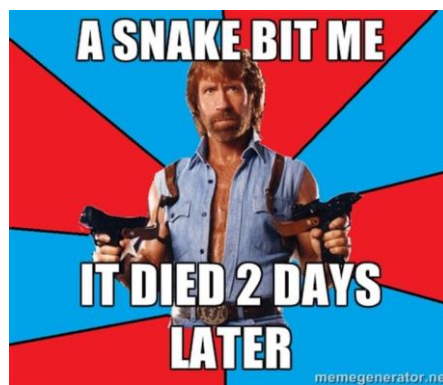
Figure 1. Chuck Norris Fact Meme

The relevancy aspect is fulfilled when the creator or meme maker creates a meme which is relevant to the meme function, for example, Chuck Norris Facts meme. In memetic society, this meme reflects that fact Norris has abilities to do anything since he is considered as invincible heroes due to his manliness.